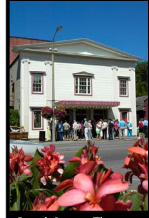
Royal George Theatre