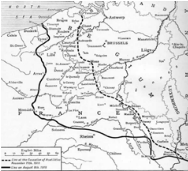
Map showing the Allied Line as of August 1918, and as of November 1918.