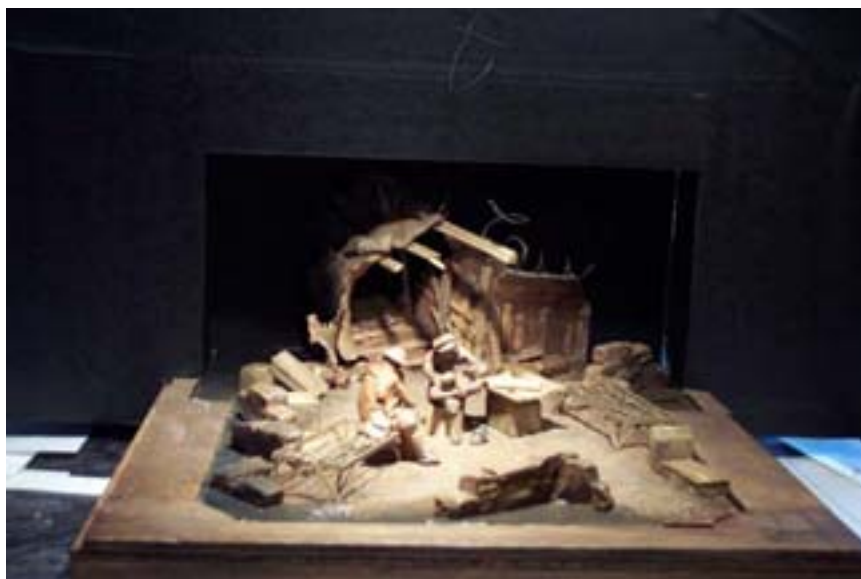
Set Model for "Journey's End" by Cameron Porteous

There is very little furniture -- ammunition crates serve as chairs and the support for a wood-planked table-top. The beds are wooden framed on low legs; there is wire mesh fixed to the frame to support the sleeping bodies. This is the world of men who live like rodents in the ground, burrowed into wet clay with hell raining down on them without warning. A world of madness created by mad men.