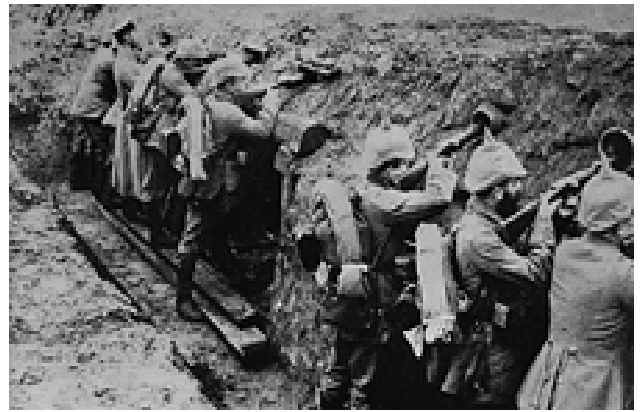
German soldiers in trenches during the Battle of the Marne, 1914

The trenches were not distinct parallel lines, but a rabbit-warren of fire, communication and supply lines where getting lost was a very real possibility. Most of us think of the Great War in terms of life and death in the trenches, but in fact only a relatively small proportion of the army actually served there. The majority of the troops were employed in the mass of support lines that ran behind the front lines. These lines were used for carrying out the wounded, moving supplies, training establishments, stores, workshops, and headquarters. Nowhere was considered safe, but the front lines were the most dangerous places to be, and that's where soldiers of the infantry were sent.