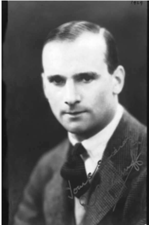
Photo: R.C. Sherriff

based on his war experiences, at first calling it Suspense , then Waiting , and finally Journey's End . After a slow initiation, the play began to enjoy enormous success, and soon Sherriff was earning over £1,000 a week from royalties. The success of the play changed his life for ever.