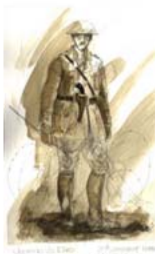
Costume Design for Jeff Meadows by Cameron Porteous

During the frigid winter months uniforms became varied and less conventional. Men started wearing non-standard issue such as goatskin fleeces or leather jackets. Many forms of headgear and gloves were coveted for warmth – balaclavas, scarves, and all types of gloves.