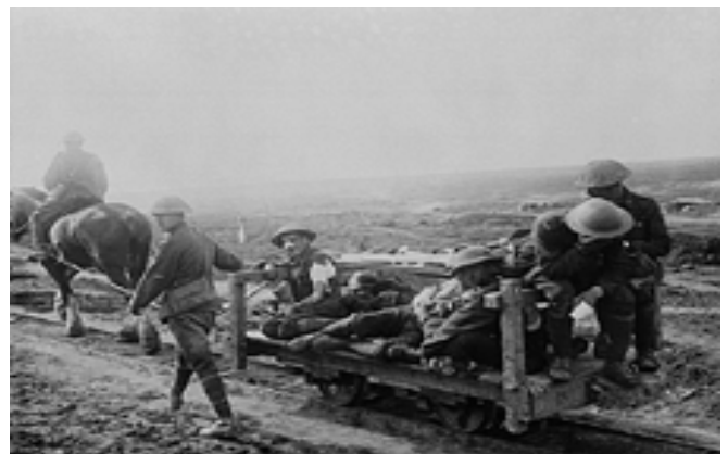
Wounded Canadian soldiers en route to dressing station via light railway, 1916.

During the War: From the moment the German Army moved into Luxembourg on August 2, 1914 to the Armistice on November 11, 1918, the fighting on the Western Front in France and Flanders never stopped. There were quiet periods, just as there were the most intense, savage, huge-scale battles; some were won, many were lost. Break-through never came until August 1918, when in the last hundred days of the war the British army spearheaded the defeat of the Germany.