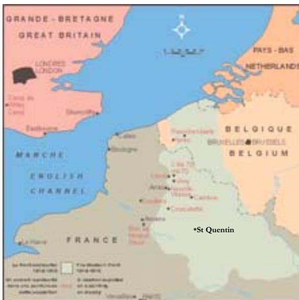
Map of the Western Front, 1914-18

July 1936 Vimy Memorial unveiled in France.