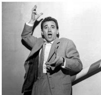
French singer and songwriter Charles Aznavour (1924-2018) at Moulin Rouge, 1955.

I haven't even touched on Paris the coquette, Paris the sly fox, insouciant, blasé, sophisticated, you name it. Our idea of Paris is so many things but importantly, none of them half-way. I guess that's it: Paris is a glass full of wine, of love, of sorrow, of joy, of romance. La Vie en Rose is a life totally consumed. Come fill up your glass with us.