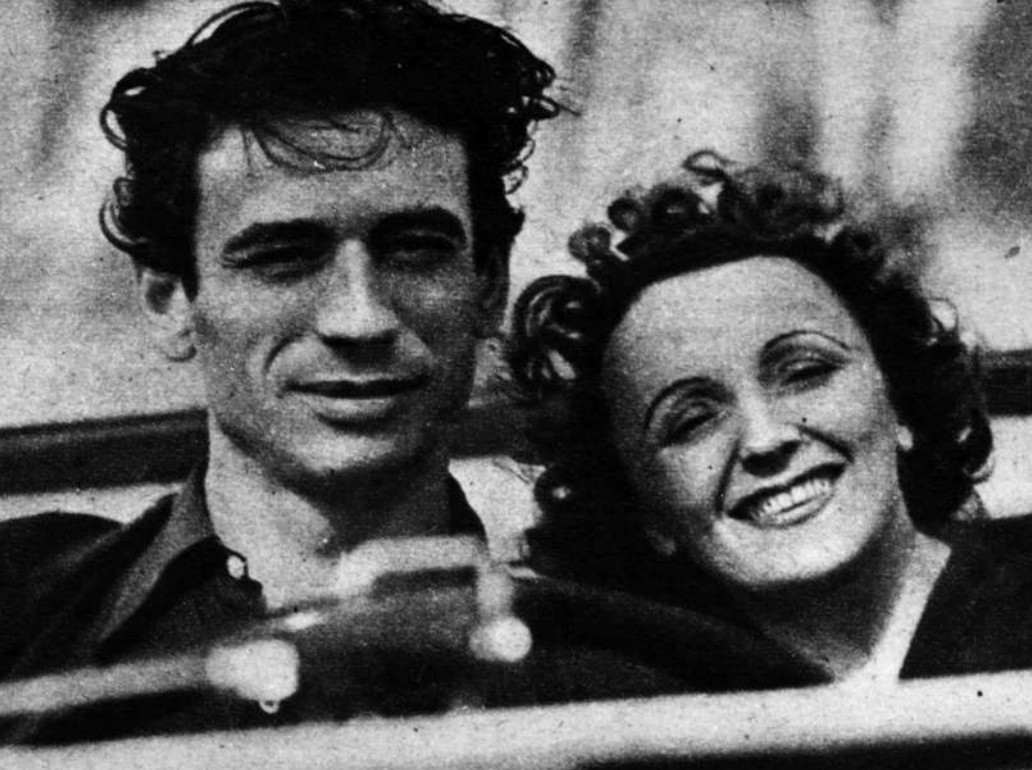
Top: Yves Montand and Édith Piaf © Archives Charmet/Bridgeman Images.