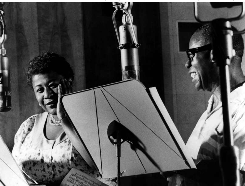
Bottom: Ella Fitzgerald with Louis Armstrong during a recording, New York, 1950.