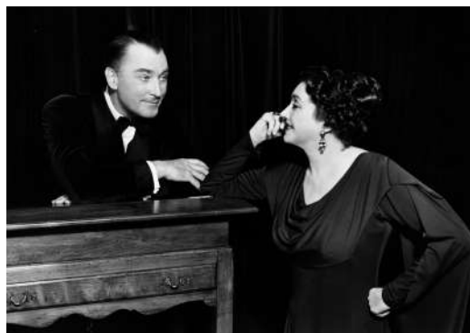
Brian Aherne as George Bernard Shaw and Katharine Cornell as Mrs Patrick Campbell in Dear Liar (1960).