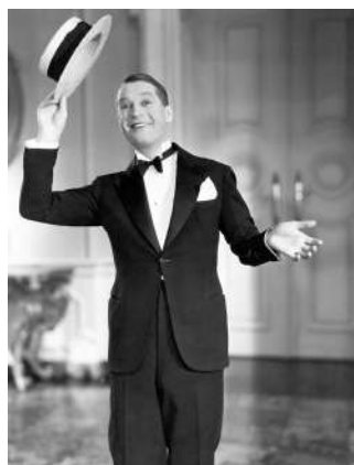
French singer and actor Maurice Chevalier (1888-1972).

French cabaret began in Paris in 1881 when Le Chat Noir opened its doors in Montmartre. Later, Black performers like Josephine Baker moved to Paris and found a more accepting, even adoring audience. Gay artists like James Baldwin and Langston Hughes spent formative years there, freed from the constraints of North American norms. Cabarets also featured jugglers, dancers, fortune tellers, and soon included political satire and drag performers. But Parisian cabaret's success ultimately grew out of the French popular song.