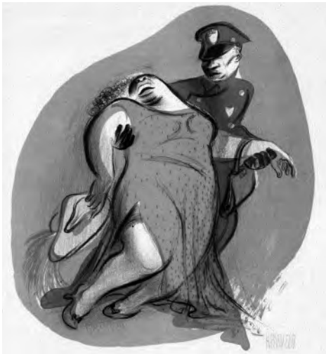
A lithograph entitled "Plastered" from "Harlem: As Seen by Hirschfeld" (1941)

celebrated, they were then decried by moral purists as sites of social deviance. Many figures from the period are now understood by biographers and historians to have been queer, but few were out in the way that term is used today. One exception was Bruce Nugent, a charismatic writer and visual artist who walked on to a bit part in the era's hottest touring play, Porgy , and hosted parties at an apartment christened with an unprintable moniker. (It borrowed a portmanteau of literati and a racial slur, coined by the era's queen of cheek, Zora Neale Hurston.)